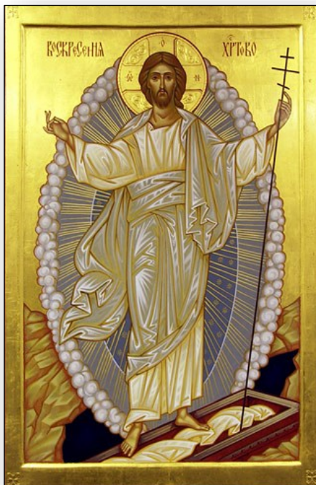
The Resurrection of Our Lord - April 20th

Palm Sunday is not just about the entrance of Christ into Jerusalem, it also refers to us as Christians having to be prepared to receive Christ into our lives, and accept His will is supreme over us.