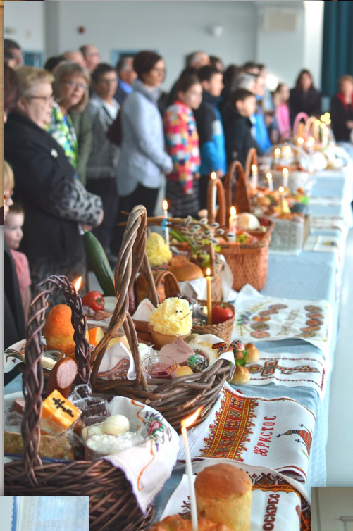
Below: Basket blessing at St. Elia's, Bonnyville.